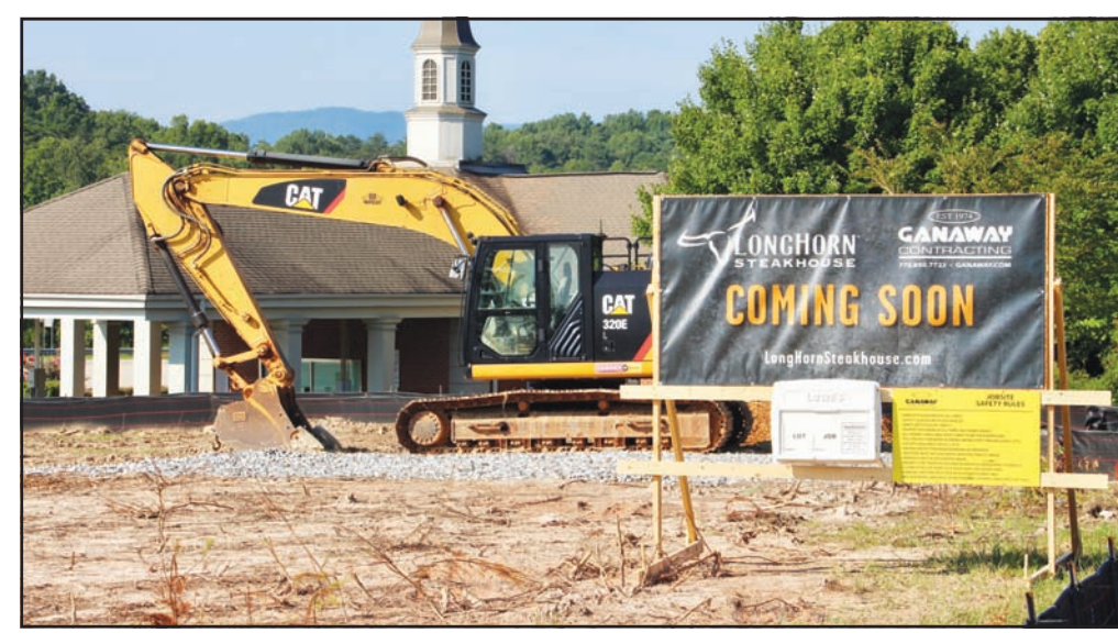
A sign announcing LongHorn appeared at the future site of the restaurant along Brackett's Way in Blairsville last week.